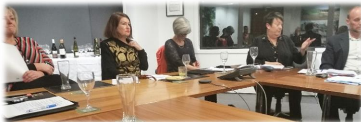
HBFG is now at the HB Primary Producer Group table