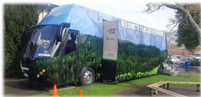
The Careers Coach offers great potential promoting forestry here