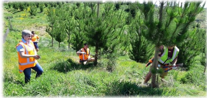
HBFG is now effectively collaborating with MOE on careers