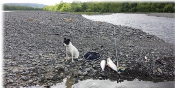
Agreeing on how best to use the Tutaekuri, Ahuriri, Ngaruroro, Kereru rivers remains elusive