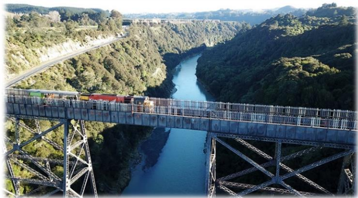
Mohaka River viaduct