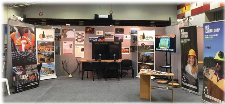
Our presentation at the Careers Expo was attractive and popular