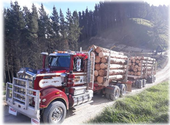
Both parties support moving from an administrative to a user pays charge